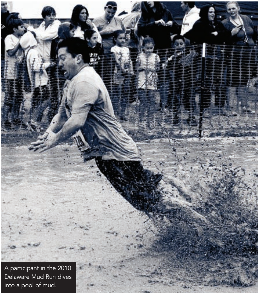
A participant in the 2010 Delaware Mud Run dives into a pool of mud.