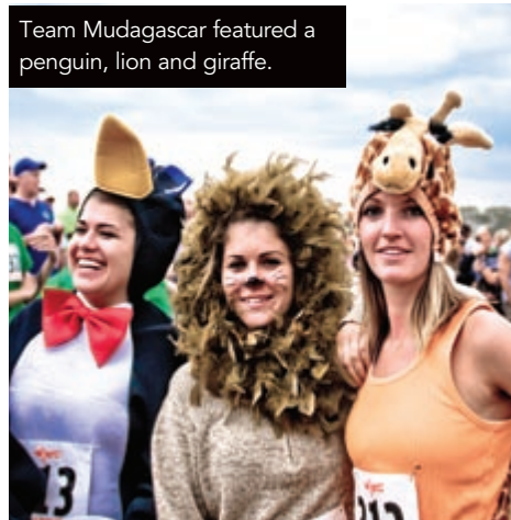
Team Mudagascar featured a penguin, lion and giraffe.