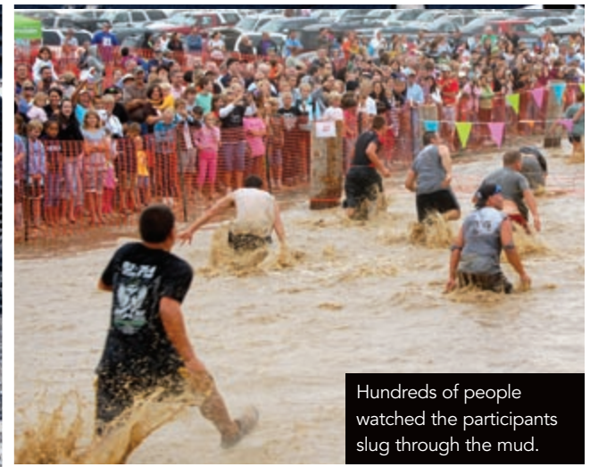
Hundreds of people watched the participants slug through the mud.